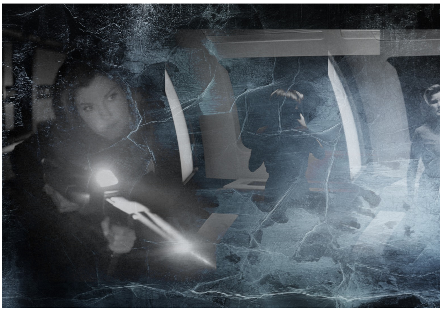
[Three greyscale images of Kathryn Janeway from the season five episode Night against a cracked stone background faded with no text.]